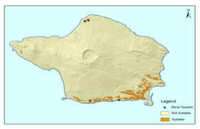
Figure 5. Potential rural tourism siting in Faial island

Anther issue to address is the environmental pressure from tourism. Patterson et al., (2006) evaluate this issue and refer that "the complexity of the challenge at hand can no longer be understood in terms of a single management objective that can be attained. It is critical that environmental managers are assisted in setting an adaptive, rather than static carrying capacity, which responds to a framework of nature's rules, that captures the adaptive and evolutionary nature of adaptive cycles that are nested one within the other across space and time scales".