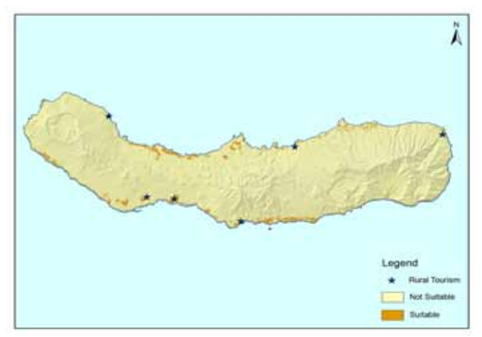
Figure 4: Potential rural tourism siting in São Miguel island

Fleischer and Felsenstein (2000) stated that "while tourism is heralded as job generating, it is also blamed for creating low wages and only seasonal employment". This may be overcome if tourism is conciliated with agriculture, provided that technical conditions and skilled labour are granted, in order to supply good quality products (agricultural and touristic) in the same space.