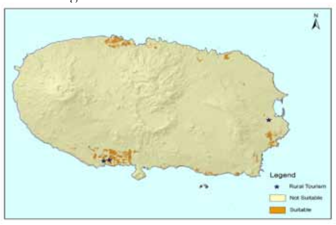
Figure 3: Potential rural tourism siting in Terceira island

Potential aptitudes for the rural tourism, resulting from crossing the referred aptitudes and determinant factors were defined in a spatial scale, through the use of GIS. These are presented for Terceira Island in Figure 3, for São Miguel Island in Figure 4 and for Faial Island in Figure 5, as well as the existing rural tourism facilities. This output can be used to assess the best sites for rural tourism, serving as a tool for decision-making.